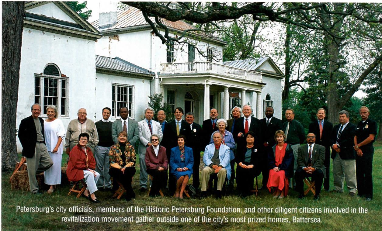
Petersburg's city officials, members of the Historic Petersburg Foundation, and other diligent citizens involved in the revitalization movement gather outside one of the city's most prized homes, Battersea.